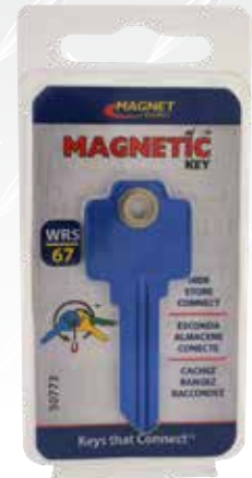
2 In. W x 4 In. H Clamshell