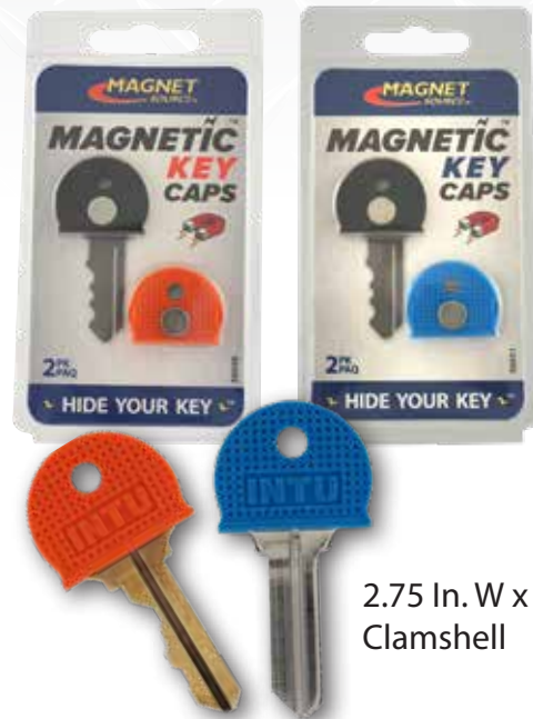
2.75 In. W x 5 In. L Clamshell